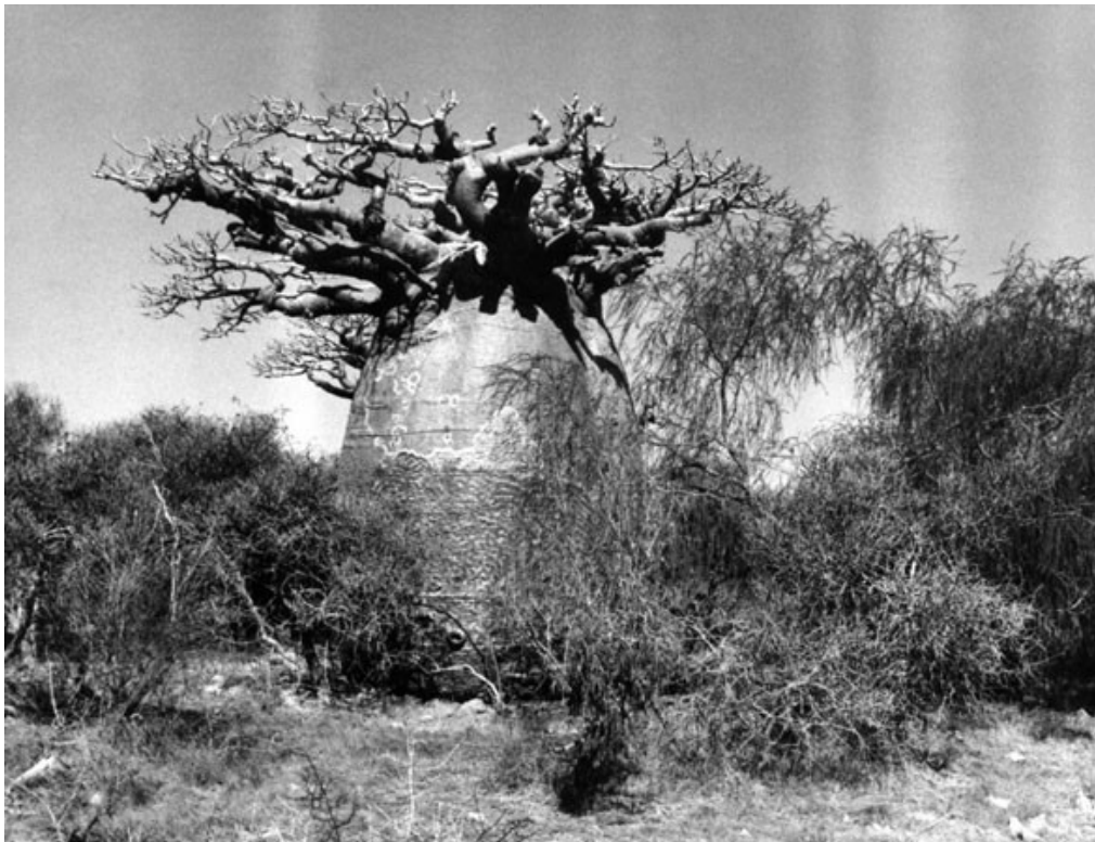
Tacita Dean, « Baobab », 2002

OPENING HOURS: From Thursday to Sunday, from 2pm to 7pm, or by appointment.