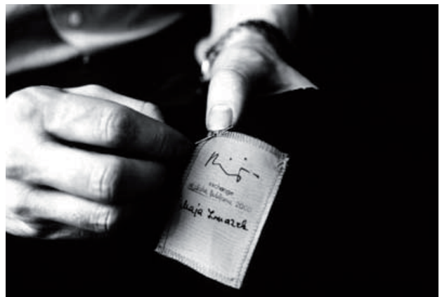
Exchange , Ljubljuna edition with the store «Cliché», black and white photograph, 2000

Archive begun 1995. agnes b. pour hommes, New York City, for three days. The store's seamstress and twenty customers participated. Twenty shirts worth $2,934.00 given. Project can be repeated.