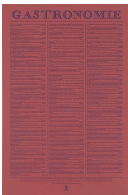
Broadsides, printed letter on Fabiano Ingres paper, framed, 2009 and 2005