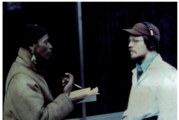
Kinmont with participant at Murray & Broadway, NYC, 1992

« 96th and Broadway, 16th and Eighth Avenue, and Murray and Broadway. Four hours and forty-one minutes on the street. 750 catalytic texts given. Fifty-eight people stopped and spoke with me. Sixteen gave me their signatures and addresses, each being mailed a $40.00 check one year later.» Project cannot be repeated.